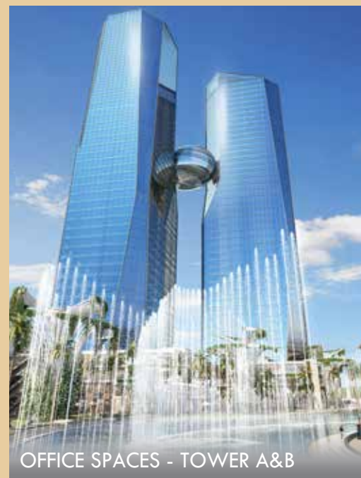
OFFICE SPACES - TOWER A&B