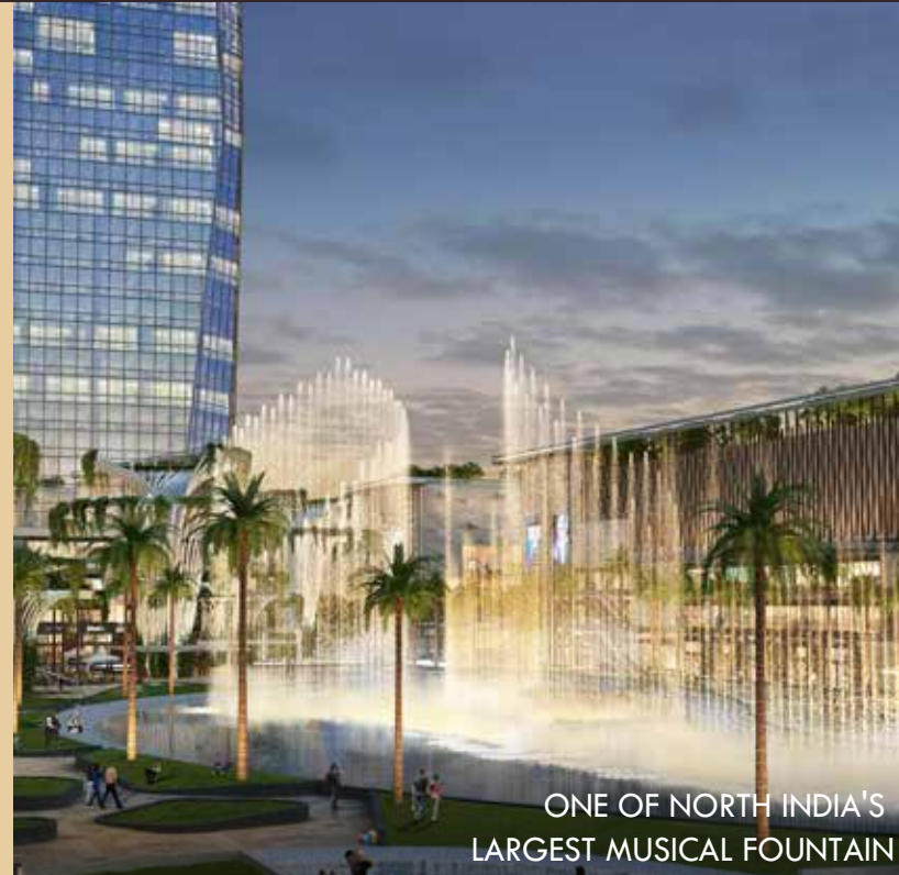
ONE OF NORTH INDIA'S LARGEST MUSICAL FOUNTAIN