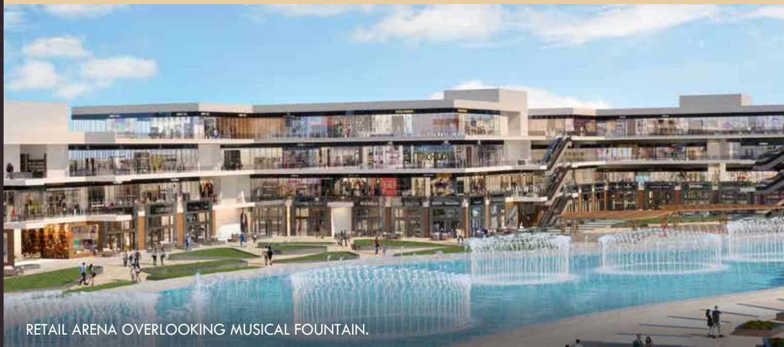
RETAIL ARENA OVERLOOKING MUSICAL FOUNTAIN.