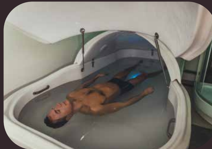
SENSORY DEPRIVATION TANK